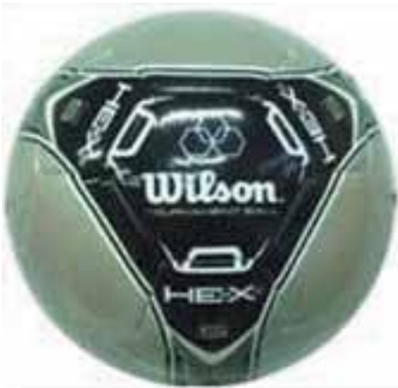
HEX II W-H8400