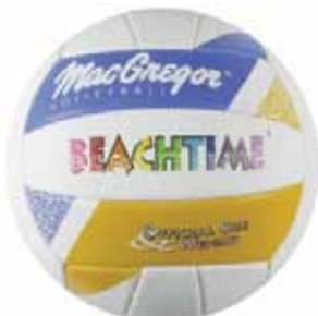
96470 - Beach Time