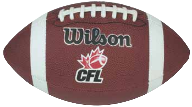
CFL MINI F1601