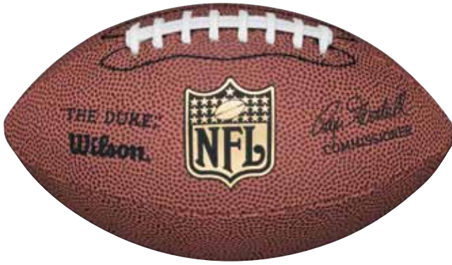
NFL MINI F1631