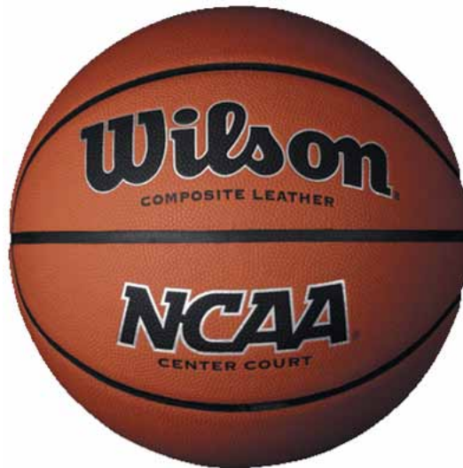
CENTER COURT B0935