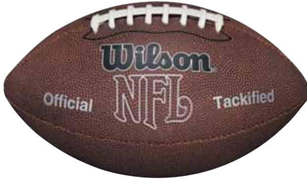
NFL MVP F1415