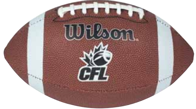
CFL MVP F1420