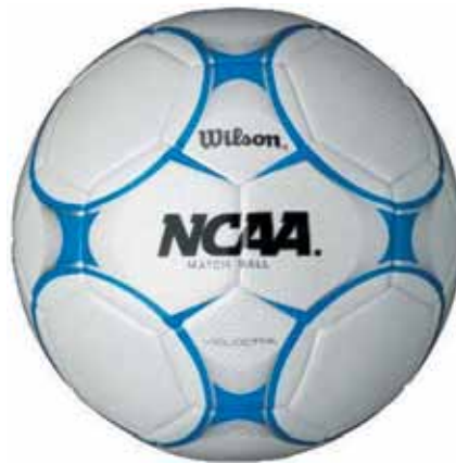
NCAA VELOCITA W-H9100