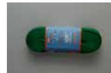
1810 Kelly Green