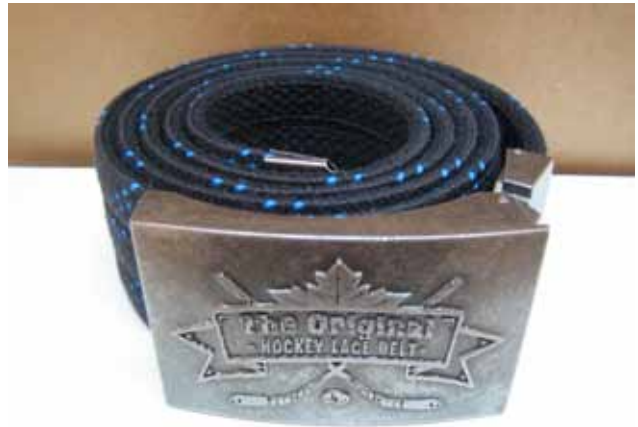
HOCLEY LACE BELT