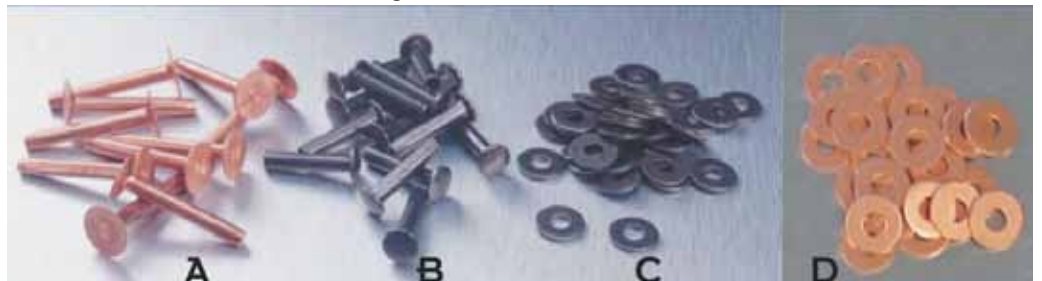
A Copper Rivets - Pkg 100 including steel washers