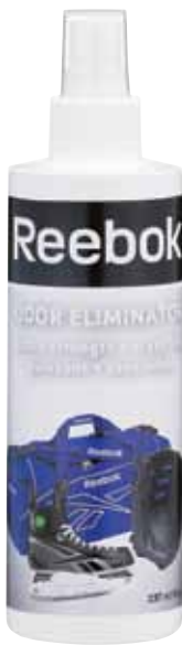
ACSPRY Odor Eliminator