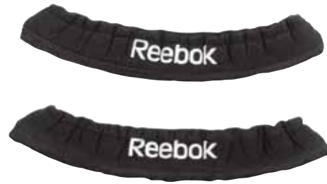
ACBCVR REINFORCED BLADE COVER