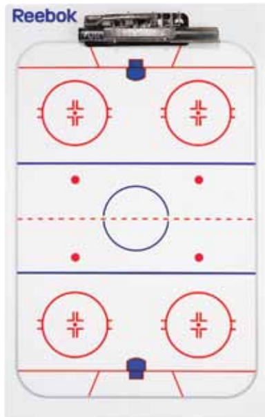
ACCBRD 16 X 10 COACHING BOARD