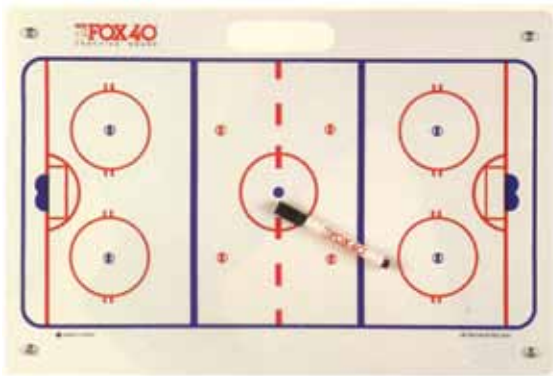
Hockey Wall/Rink Mount 16 x 24