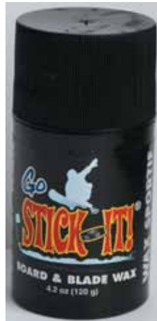
Stick It Stick Wax