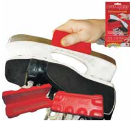
L'il Red BLR1000A