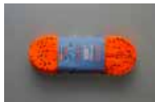
1810 Fluor Orange