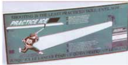
Practice Ice 32 x 14