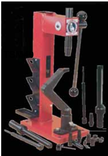
TSM811T Bench Riveter