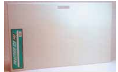
Practice Ice 40 x 24