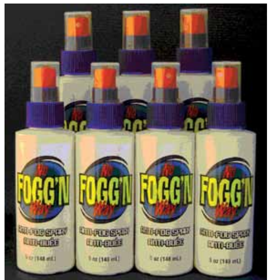
No Fogg'n Way