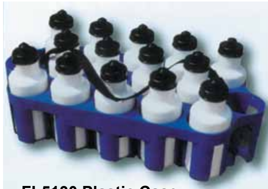
FI-5130 Plastic Case 1/2L Bottles *Bottles sold separately