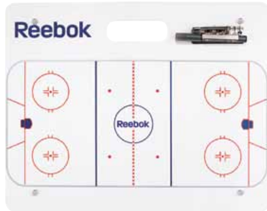
ACCBRD 20 X 16 COACHING BOARD