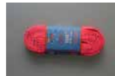
1810 Hot Pink