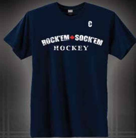
RSH-CAPTIAN-T CAPTAIN COLOUR: NAVY