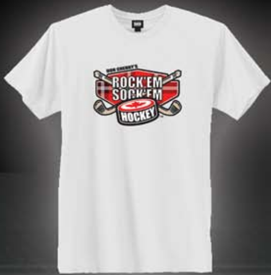
RSH-PLAID-T PLAID COLOUR: WHITE