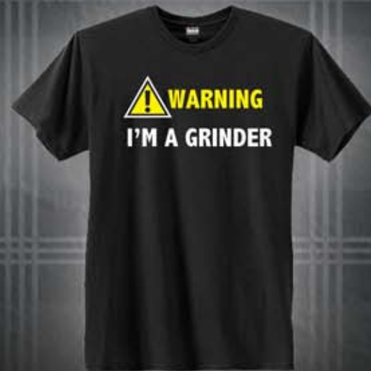
RSH-GRINDER-T GRINDER COLOUR: BLACK