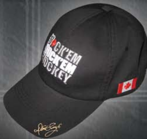
RSH-HAT-WM WORDMARK LOGO COLOUR: BLACK