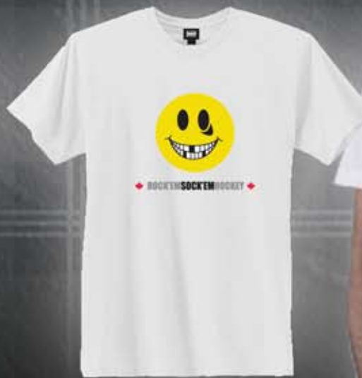
RSH-100%-T 100% COLOUR: WHITE