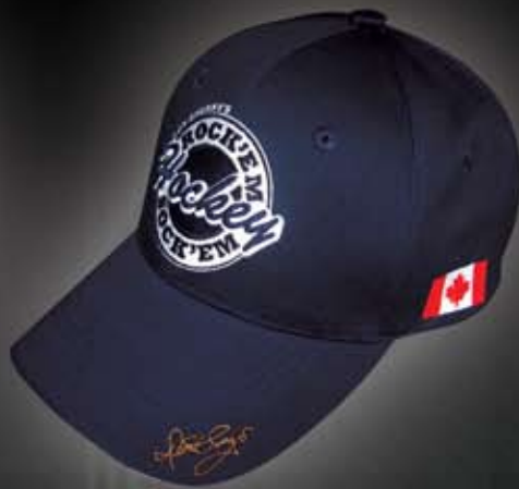
RSH-HAT-VIN VINTAGE HAT COLOUR: NAVY