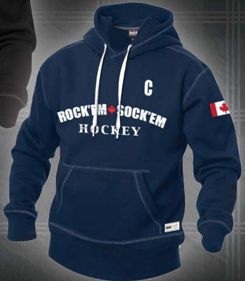
RSH-CAPTAIN-HOODIE CAPTAIN COLOUR: NAVY