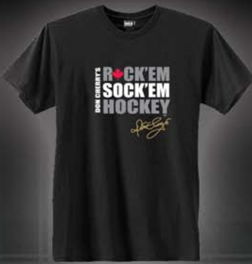
RSH-STACKED-T STACKED COLOUR: BLACK