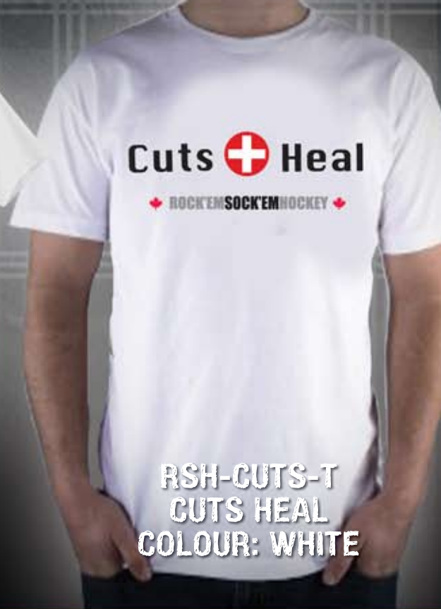
RSH-CUTS-T CUTS HEAL COLOUR: WHITE