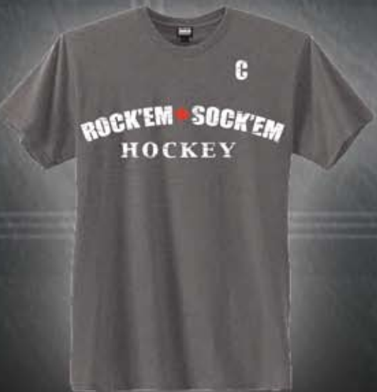
RSH-CAPTIAN-T CAPTAIN COLOUR: GREY