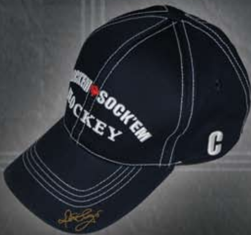
RSH-HAT-CAP VINTAGE LOGO COLOUR: NAVY