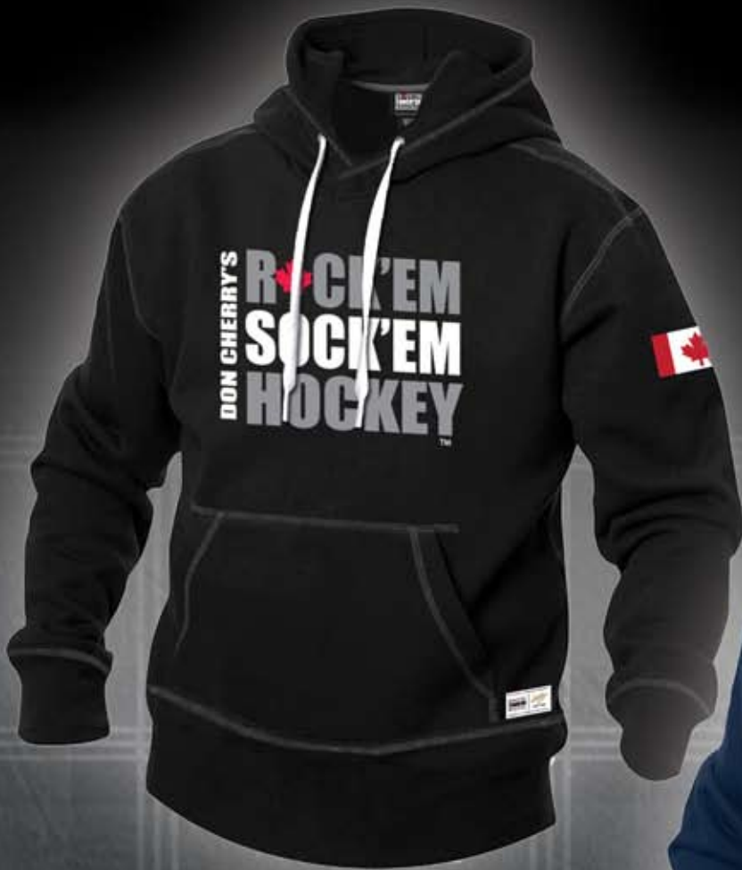
RSH-STACKED-HOODIE STACKED COLOUR: BLACK