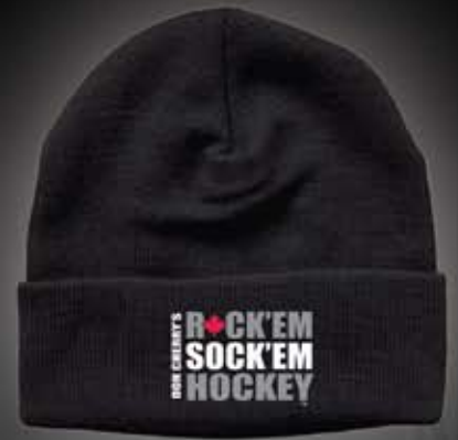
RSH-SIMPLE-TOQUE SIMPLE TOQUE COLOUR: BLACK