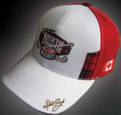
RSH-HAT-PLD PLAID HAT COLOUR: WHITE/RED